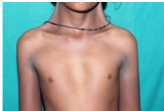
Figure 2: Webbed neck, shield chest and cubitus valgus