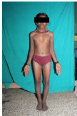
Figure 1: Short stature, webbed neck, shield chest and cubitus valgus

short stature, webbed neck, shield chest, cubitus valgus, low hairline, high arched palate, short fourth metacarpals, renal and cardiovascular anomalies, etc. In 1959, it was recognized that Turner's syndrome resulted from the loss of an X chromosome or essential parts of it. Turner Syndrome is characterized by sexual infantilism, webbed neck, short stature, peripheral edema, lymphedema, renal and cardiovascular anomalies, gonadal dysplasia, some learning disability etc. (1). We present here 14 year old girl with primary amenorrhea who had classical features of Turner's syndrome.