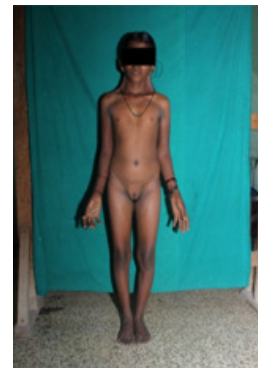
Figure 3: Tanner stage 1 of breast and Pubic hair