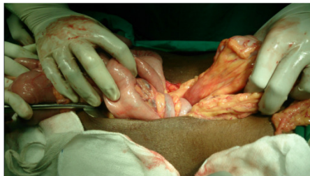
Figure 3: Intra operative picture shows volvulus of proximal jejunum