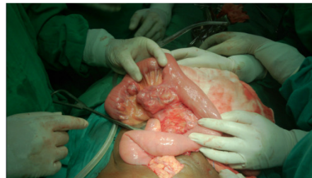
Figure 4: Intra operative picture shows multiple jejunal diverticuli in the summit of volvulus