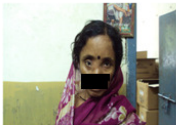
Figure 1: Photograph of Patient with Schizencephaly

On General Examination, Patient was conscious, co-operative, comfortable in supine position PR-78 bpm, regular, BP-110/70 mm of Hg, Dacrocystitis of right eye is present, No clubbing, cynosis, icterus, paller, lymphadenopathy, edema fee, No skull, spine, skin or nail abnormality, No neurocutaneous markers were present. On Systemic Examination, CVS, RS, and Per Abdomen – No Abnormality was detected. On Central Nervous System Examination, Higher function like Consciousness, Behavior and Memory all were in normal limits. Her Intelligence was average; Mini Mental Examination Score was 26. Her Cranial nerve examination, Sensory system examination were within normal limits On Motor system Examination there was Left spastic hemiparesis with grade 2/5 power in upper limb and 4/5 in left lower limb. Left Deep Tendon Reflexes were exaggerated, left planter- extensor and Right sided all deep tendon reflexes were Witin Normal Limits.