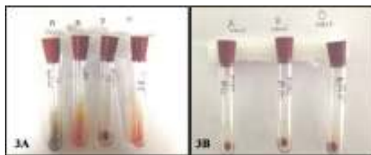
Figure 3: Forward and Reverse grouping by Tube method