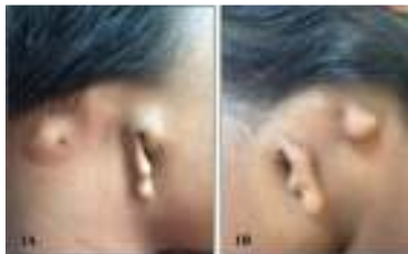
Figure 1: Bilateral Microtia with Supra-Auricular fistula

A, B and O pooled cells (prepared in-house in our blood bank) against patients serum, which showed agglutination in all three tubes, thus revealing the presence of Anti A, Anti B and Anti H antibodies ( Figure 3B). So the blood group was reported as Bombay O Rh positive.