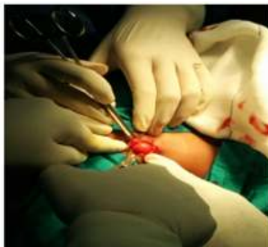
Figure 2: Intrap excision of the posterior auricular swelling