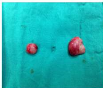
Figure 3: Post op pic of excised posterior auricular masses