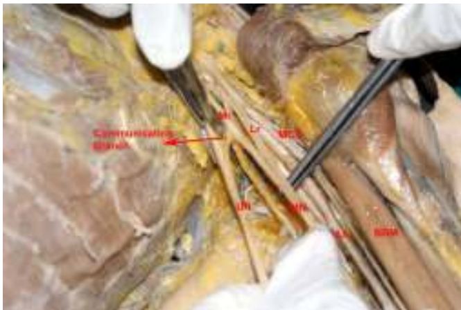
Figure 3: Communication between Ulnar and Median Nerve

In present study, there were communications between ulnar nerve (UN) and median nerve (MN) in 4 cases [Table-2]. Communicating branch was present in between the medial root of median nerve (MN) and ulnar nerve (UN). This communicating branch arose from the medial root of median nerve (MN) distal to its origin and run medially and slightly downwards to join the ulnar nerve (UN) distal to its origin [Figure-3].