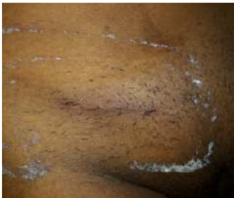
Figure 4: Post operative day seven.

Patient on discharge on post-operative day seven and it was uneventful.