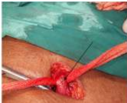
Figure 3: After marsupialisation, round ligament intact shown by a black arrow

Hydrocele sac was seen around the round ligament. Sac was separated, opened and contents [amber coloured] were drained. Proximal sac was laid open and marsupialisation was done leaving the round ligament intact. Haemostasis was secured. Incision was closed in layers.