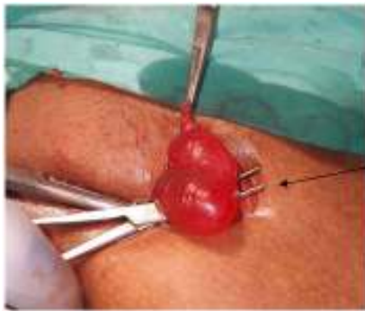
Figure 2: Right groin crease incision made and hydrocele sac identified by black arrow

Pt was evaluated for surgery and was posted under SA after obtaining consent, R groin crease incision was made and opened in layers.