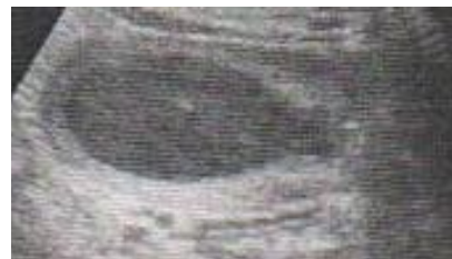
Figure 1: U.S.G showing edematous gall bladder wall

Patient was investigated further. On hematological investigation the only significant finding was leucocytosis with TLC 15000/cmm. There was no increase in hepatic transaminases as well as serum bilirubin.