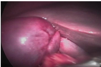
Figure 4: 360 degree torsion at body-neck junction