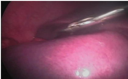
Figure 3: Mobile gall bladder