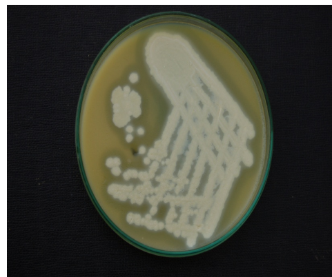
Egg Yolk Agar Plate Lipase activity with pearl like reaction.