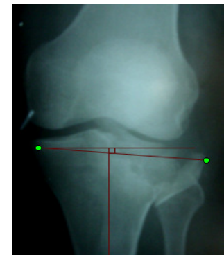
Figure 3: Measurement of tibial plateau tilt