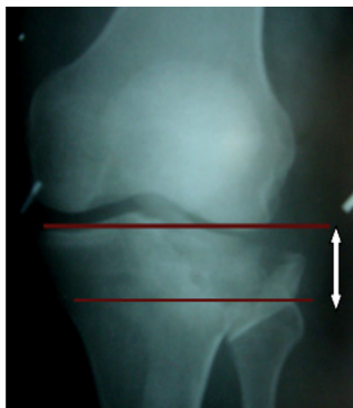
Figure 1: Measurement of Articular depression/step off

20 patients with closed tibial plateau fractures [18 males and 2 females; mean age, 44.4 years (range 20-67 years)] were treated operatively using principles advocated by AO/AISF. All patients were studied prospectively. The right knee was involved in 8 patients and left knee in 12 patients. The modes of injury were road traffic accident (in 13 patients) or slip and fall (in 7 patients). Patients with multiple injuries, open fractures and with age below 18 years were excluded from the study. Pre-operative planning consists of antero-posterior and lateral view radiographs in all cases, and amount of displacement, articular depression/step-off, and angulation were recorded. Based on the radiograph, fractures were classified according to Schatzker's staging system 3 . According to the Schatzker's Classification, there were 12 fractures of type II, one fracture of type III, five fractures of type V, and two of type VI. Condylar depression/step-off (Fig: 1) was measured from a reference line level with the uninjured tibial plateau. Condylar widening (Fig: 2) was obtained by measuring total width of tibial plateau just below the joint line and measuring the width of femoral condyles just above the joint line. These two measurements are normally equal. Tibial plateau tilt (Fig: 3) was measured by angle drawn between line perpendicular to the long axis of the tibia and line along the depressed tibial plateau. Surgery performed as per the type of tibial plateau fracture.