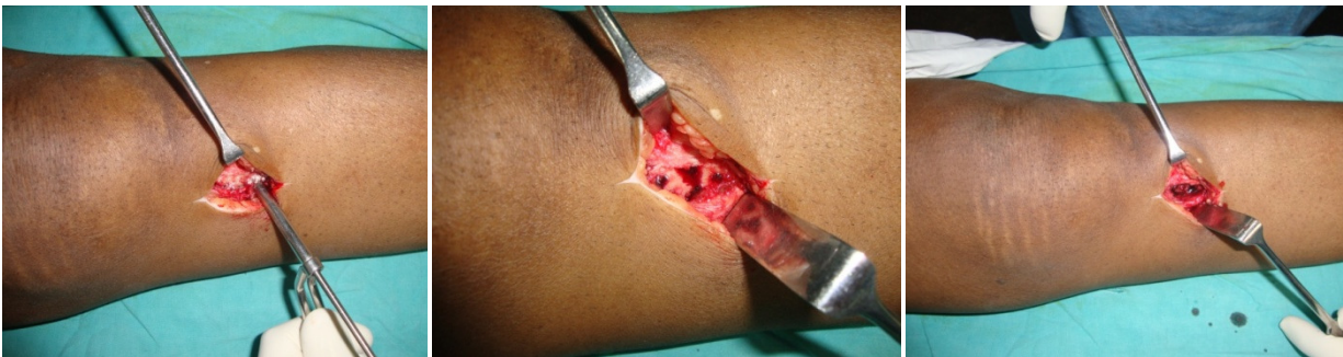
Figure 5: Creation of trap door

All fractures were treated according to the principles advocated by AO/AISF. These principles include anatomic restoration of joint surface, rigid internal fixation to obtain a stable painless knee joint with normal range of motion controlled by well-functioning muscles. A trap door (Fig 4) of around 1×1 cm was created in the proximal tibial metaphysis using a small osteotome. A punch was inserted through the trap door (Fig 5), and the height of the tibial plateau is carefully restored. Depressed fragments were elevated to the anatomic joint line. The reduced fragments were maintained temporarily in anatomical position by K-wires.