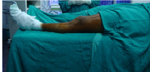
Figure 4: positioning of patient

The patients were operated under spinal anaesthesia AND SUPINE POSITION (Fig 3). The type of surgical procedure undertaken was determined in part by the condition of soft tissues and other factors that determine the ‘personality of the fracture’.