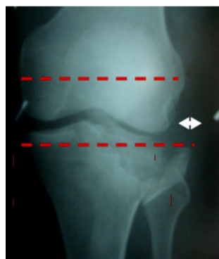
Figure 2: Measurement of condylar widening