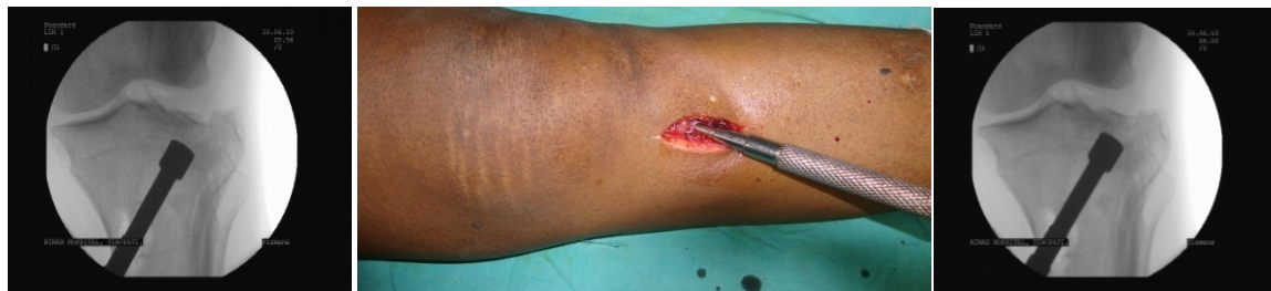
Figure 6: Elevation of the depression