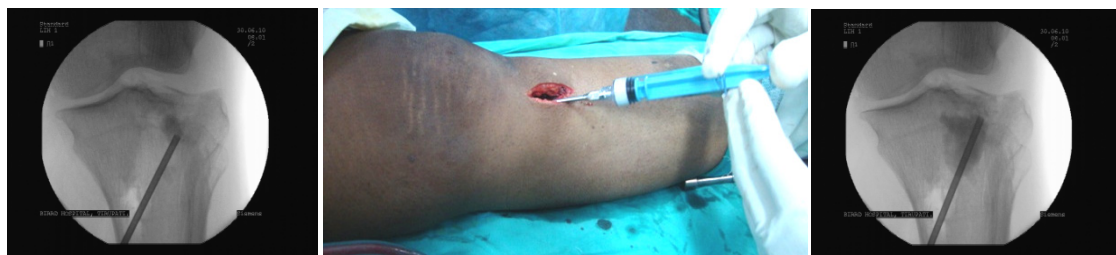
Figure 7: cement inserton