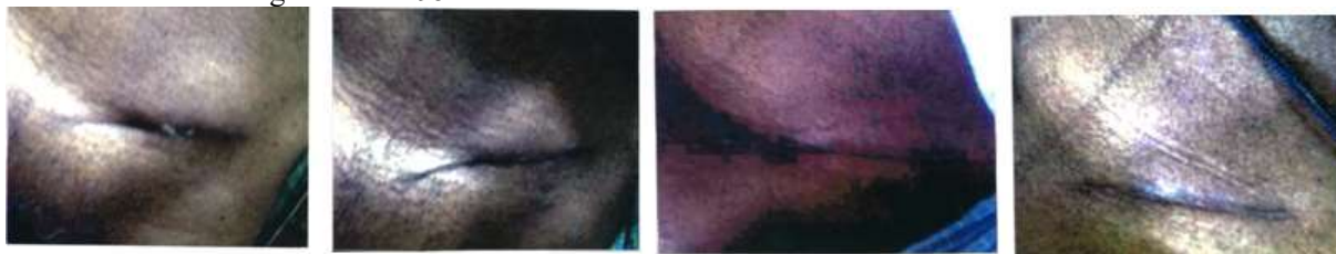
After 6 weeks

The results of cosmesis assessment for 3 rd , 6 th and 12 th month weretaken. The results were analysed using students paired t-test and the difference is significant at 95% level of confidence.