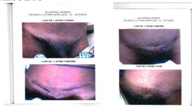
Figure 1: The results of cosmesis assessment for 3 rd , 6 th and 12 th month are given in tables