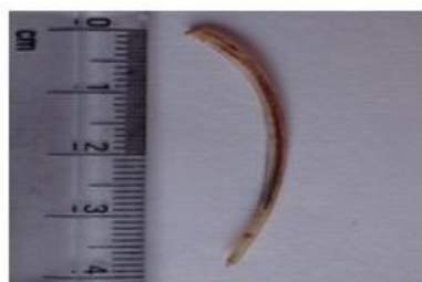
Figure 1: Fish bone of length 4cm

kept in pelvis. Post-operative period was uneventful. Drainage tube was removed on fifth postoperative day. Sutures removed on the eighth day and also CT done to confirm no residual or recurrent abscess. Patient on follow up after two weeks and eight weeks with healthy wound and normal bowel habits and no specific complaints.