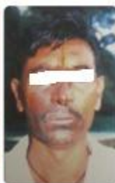
Figure 5: 27 % Burns before and after treatment