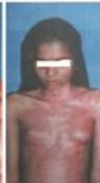
Figure 6: 12% Burns before and after treatment