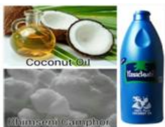
Figure 1: Ingredients used for preparation

This mixture is prepared by mixing 50 ml of coconut oil, and 4-5gms of camphor, both of which are commercially available at very low cost. Coconut oil act as solvent for the camphor and thus we get a homogenous mixture for application over burn wounds. This proportion of both components was maintained as per the need of quantity of mixture required, depending upon percentage of burns. This preparation of camphor and coconut oil mixture was