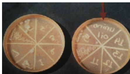
Figure 2: No growth on camphor and coconut oil mixture

Thus from above observation, we can conclude that camphor and coconut oils are having effective antimicrobial properties.