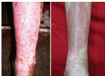
Figure 7: 9 % burns before and after treatment