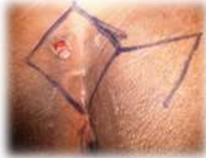
Figure 3: Preoperative marking of flap

rotation, it will be sutured to A–D ( Fig 1 and Fig 2). All the sinus tracts were excised en block deep till the pre-sacral fascia in the midline and gluteal muscles laterally (Fig 3 and Fig 4). Dissection should be restricted to presacral fascia to avoid bleeding.