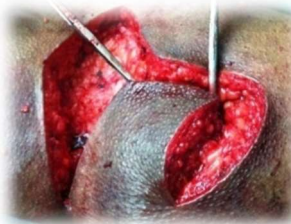
Figure 5: Gluteal Flap Fashioned

A flap was then fashioned from gluteal region incorporating the skin, subcutaneous fat and gluteal fascia (Fig 5 and Fig 6) and stitched in place with 2-0 vicryl in two layers after vacuum drain was placed down to the presacral fascia. The skin was closed with interrupted 2-0 polypropylene sutures ( Fig:7).