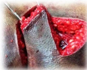
Figure 6: Flap rotated to fill the midline defect