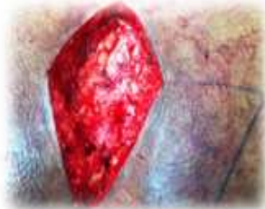
Figure 4: Excision of Rhomboid area including sinus

A flap was then fashioned from gluteal region incorporating the skin, subcutaneous fat and gluteal fascia (Fig 5 and Fig 6) and stitched in place with 2-0 vicryl in two layers after vacuum drain was placed down to the presacral fascia. The skin was closed with interrupted 2-0 polypropylene sutures ( Fig:7).