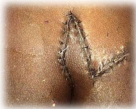
Figure 7: Limberg Flap sutured..

Patient was nursed in lateral/prone position for 24 hours. Patients received i.v. antibiotics cefaperazone with sulbactam and metrogyl postoperatively for 5-6 days. Wound was inspected daily from 3 rd postoperative day. Drains were removed on the 6-7 th postoperative day and patient was discharged at 7 th postoperative day. Patients were advised to come for follow up on 15 th postoperative day and sutures were removed on that visit. Patients were advised to maintain hygiene and keep the area clean. Follow up done in outpatient clinic at one, six and twelve months post surgery. The operative time, post operative pain, wound complications, hospital stay and recurrence rate were recorded.