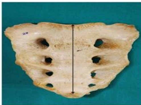
Figure 1: Ventral Straight length

< 23.58 mm was male and > 40.53 mm was female. There was complete overlapping of values for male and female sacra so could not be identified beyond DP.