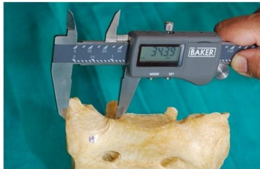
Figure 5: Length of Ala of sacrum