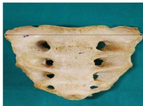
Figure 2: Maximum width of sacrum