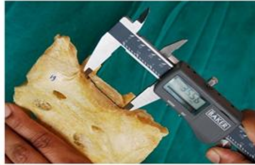
Figure 4: Transverse Diameter of body S1 vertebra