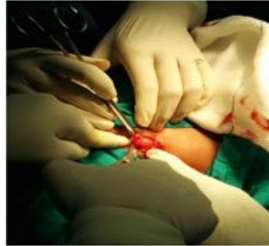
Figure 2: Intrap excision of the posterior auricular swelling