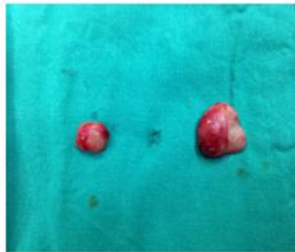
Figure 3: Post op pic of excised posterior auricular masses